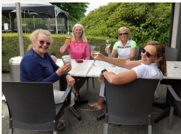
'Three of your executive members hard at work'